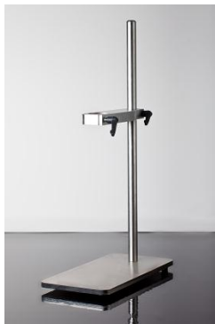
Stainless steel stand for clamping the transducer- system